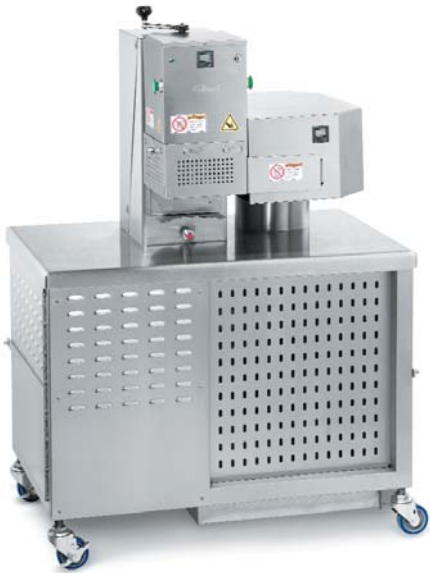
625A-PP 59" x 29" x 43" (150 cm x 74 cm x 109 cm)