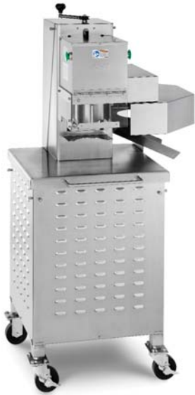
625A-CT 50" x 24" x 24" (127 cm x 61 cm x 61 cm)